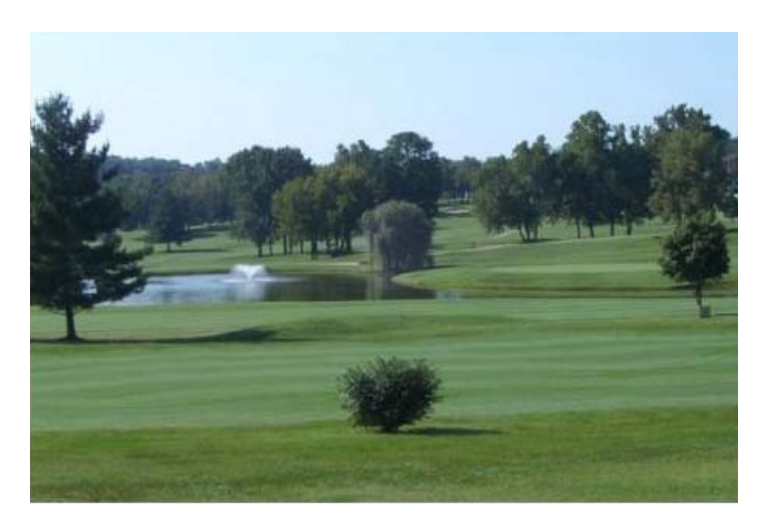
Lake Valley Golf Course