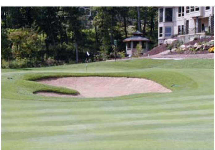
Old Kinderhook Golf Club