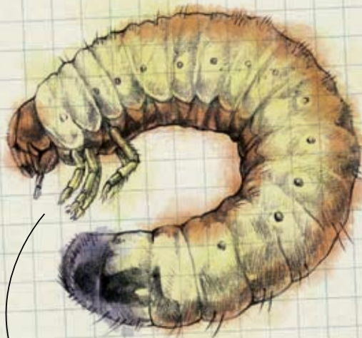
Japanese Beetle Grub

The Environmental Institute for Golf is helping GCSAA chapters raise funds for turfgrass research, and you can help. All you have to do is donate a round to our online auctions. The funds raised will go to agronomic studies, awareness, scholarships and other education programs.