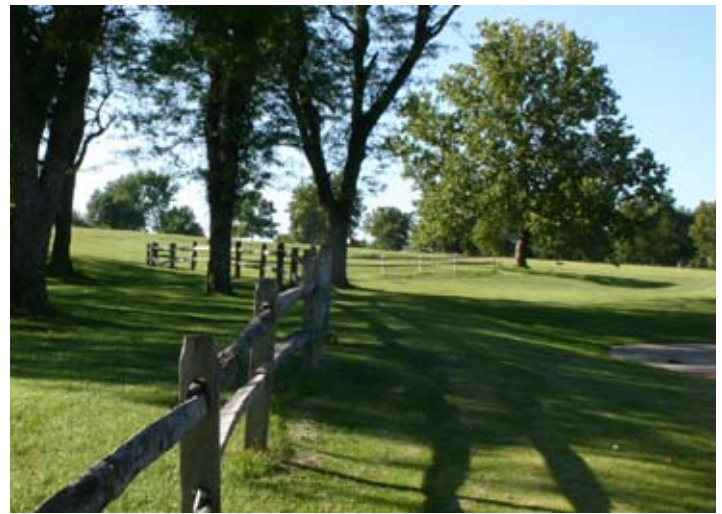
Alvamar Country Club, Lawrence, Kan. Monday, June 15, 2015