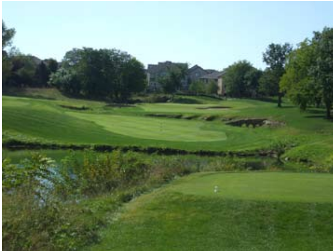
Ironhorse Golf Course, Leawood, Kan. Monday, May 18, 2015