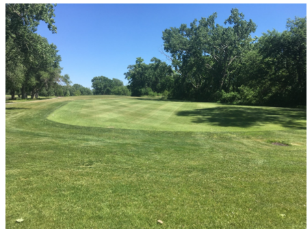
12 Fairway - 1 Year Old