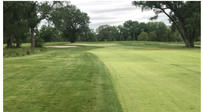
14 Fairway - May 2019

For more information on seeding zoysia, check out this comprehensive guide from Aaron Patton https://www.uaex.edu/publications/PDF/MP476.pdf