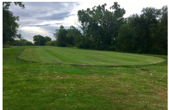
12 Fairway 79 Days After Seeding